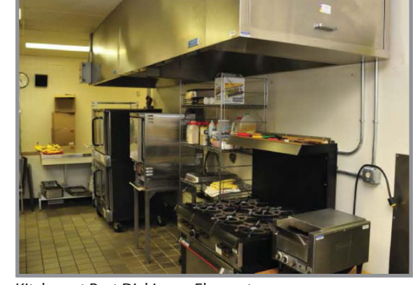
Kitchen at Port Dickinson Elementary