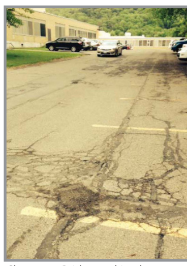
Chenango Bridge parking lot