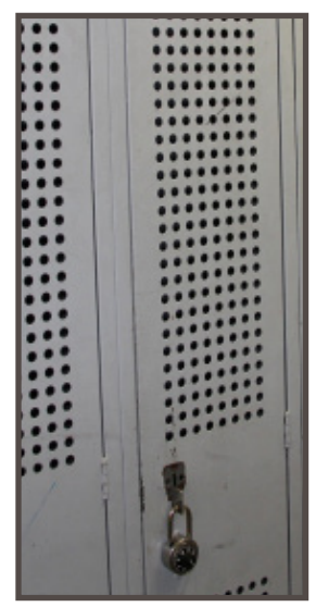
Team room lockers

Chenango Valley residents will be asked to vote on a $12.4 million proposed capital improvement project to enhance school security, improve kitchen and cafeteria areas at both elementary schools, upgrade athletic facilities and provide necessary repairs to the bus garage. Pictured below are some areas that are included in the proposed plan; a complete scope of work is listed on page 2 of this newsletter.